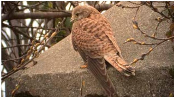
Eurasian Kestrel, Fields Landing, Humboldt Co. 01/06/2017, © Gary Bloomfield

documentation (see Western Birds 39, pages 184-187). According to Rare Birds of California , the easternmost Falco tinnunculus interstictus subspecies breeds as close to North America as northern Japan and winters as far north as southern Japan. This species occurs casually (not seen annually but reasonably expected to occur) in Alaska and accidentally in British Columbia and western Washington.