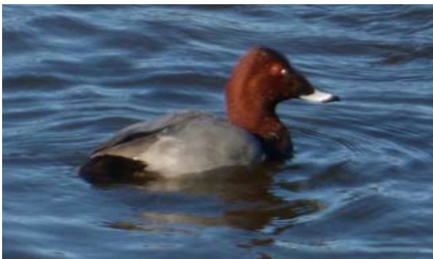
Common Pochard, Freshwater Lagoon, Humboldt Co. 01/05/17