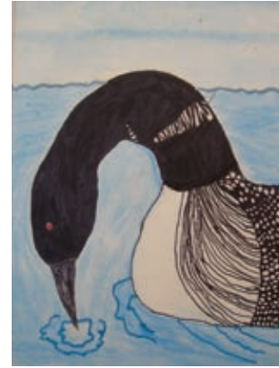
Pileated Woodpecker by Deja Coleman