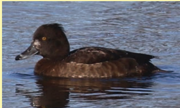
Tufted Duck, Arcata Marsh, HUM Co.