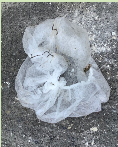
Hair Net: Fine mesh hairnet.