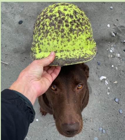
Hard Hat: Plastic hard hat.