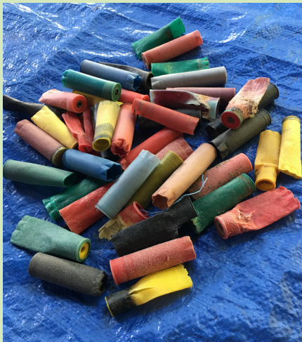
Shotgun Shells: Small colorful plastic tube, open on one end. Can come in a variety of colors.