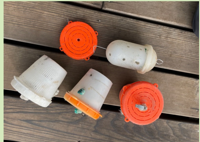
Crab Bait Containers and Lids: White or orange plastic containers with screw-on lid. Usually 4" x 4".