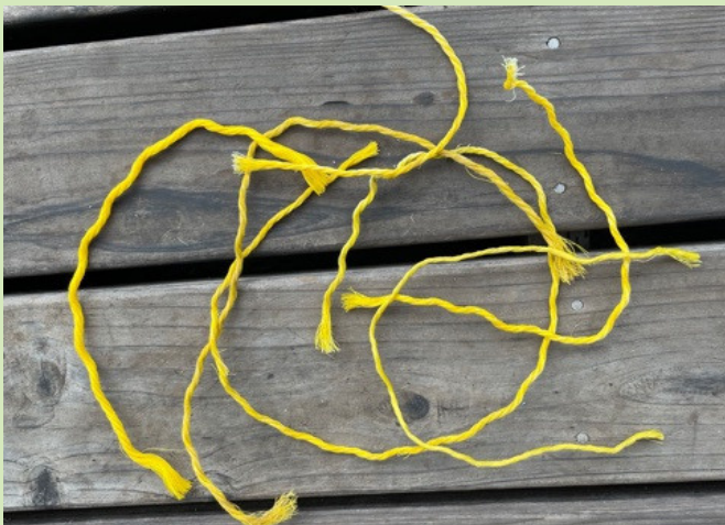
Yellow 3-Strand Rope: Bright yellow plastic rope made of three strands wound together. Usually 1-2 ft. segments.