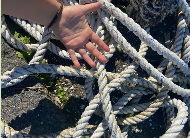
Mooring Rope: Very thick rope, usually 3-5 inches in diameter. Smaller diameter rope will be twisted (2 stranded). Bigger diameter is braided.