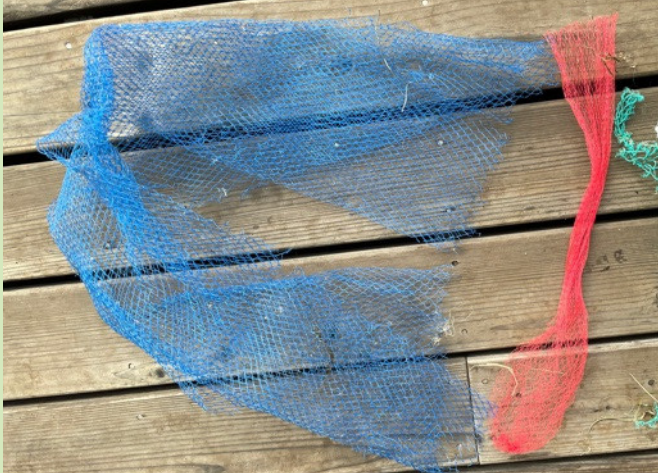
Vexar Bags: Plastic fine-mesh bags, roughly 2.5-3 ft long. Usually red, blue, or yellow in color. Sometimes these have company labels on them, so keep an eye out!