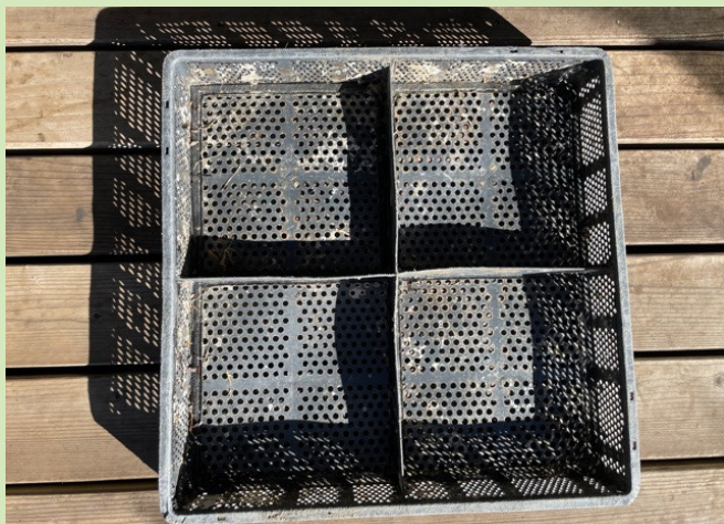
Oyster Seed Trays: Black plastic tray divided into 4 sections. Dimensions: 23" x 23" x 3"