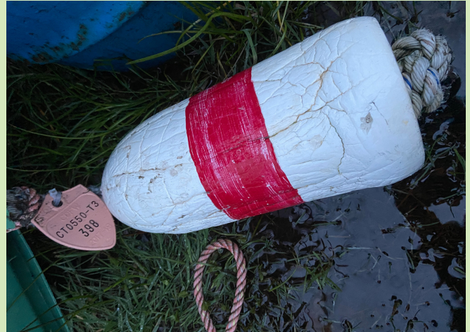
Crab Buoy: Lightweight cylindrical foam float. Usually yellow, orange, or white and red. Roughly 12" long.