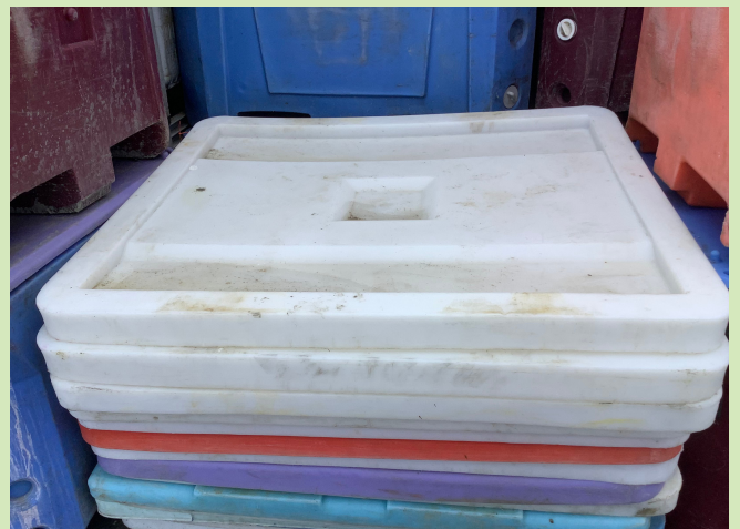
Fishing Tote Lids: Large flat plastic lids for fish totes. Dimensions: 30" x 37"