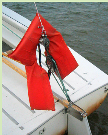
Life Jacket: Foam life jacket.