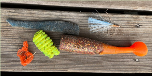
Fishing Lures: Colorful plastic lures can come in a variety of shapes and sizes.