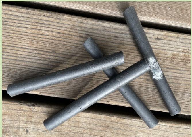
Black ABS Pipe: Sections of cut black plastic pipe, usually in 6-8" segments.