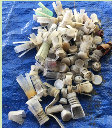
Shotgun Wads: Small plastic tube with four pronged opening on one end. Usually light colored.