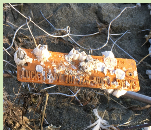
Crab Pot Label: Crab pots should be labeled with the owner's contact information. If you find an intact label on a crab pot, please send us a photo!