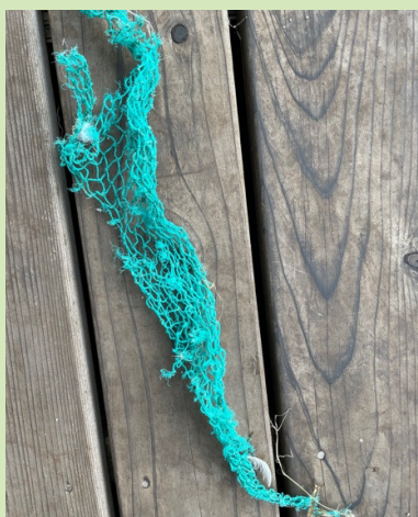
Domestic Pink Shrimp Web: 1-1.25 inch mesh web. Almost always turquoise in color.