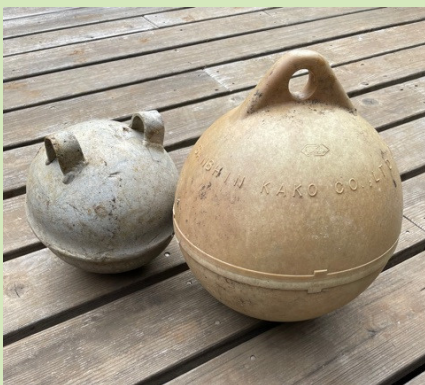
Trawl Floats: Round floats made of cast hollow aluminum or cast hollow plastic. 6-12" diameter.