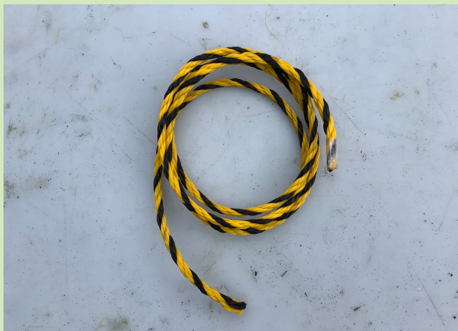
1/4 in Polypropylene Rope: Yellow and black 3-stranded plastic rope. Diameter: 1/4 in.