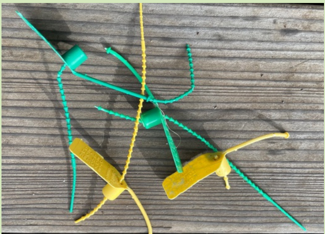
Zip Tie Tags: Colorful plastic zip ties with plastic tags attached.