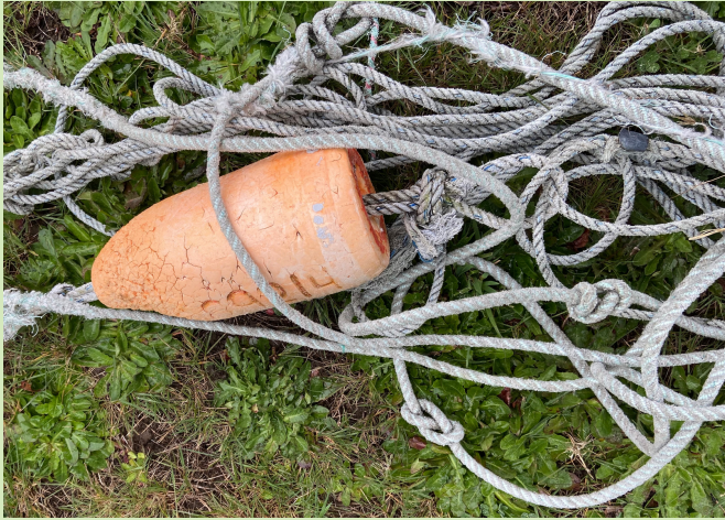
Crab Rope: 5/16-1/2" diameter 3-stranded rope.