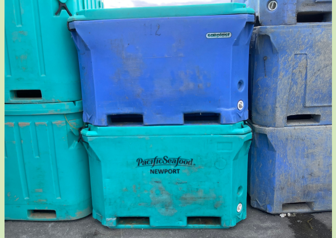
Fishing Totes: Large plastic insulated cooler for storing fish. Usually blue, teal, or white. Dimensions: 37" x 30" x 30"