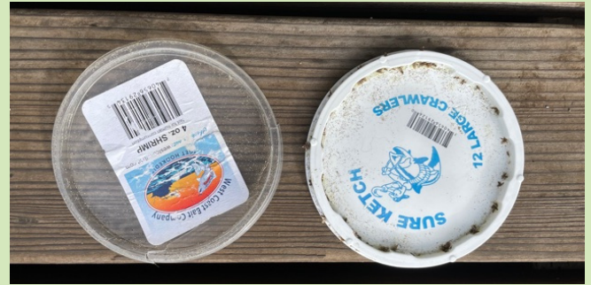
Fishing Bait Containers and Lids: Lids and containers with fishing bait labels.