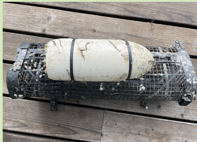
Oyster Basket: Black plastic mesh cage, usually 2 ft long. Sometimes there is a buoy attached. Mariculture Bags look similar, but are more flexible and have an opening on one end.