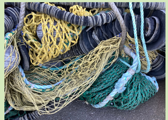
Trawl Net: Large, heavy net fragments with varying mesh size. Polypropylene twine, various colors: green, blue, orange. Thick, heavy.