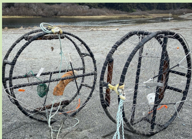
Crab Pot: Large, heavy circular trap with netting.