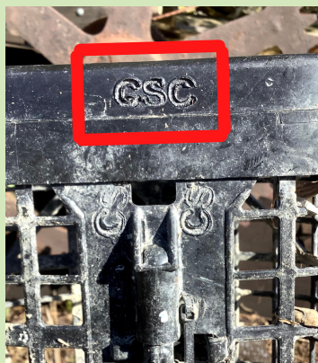
Oyster Basket Labels: Baskets should be marked to identify the company that owns the basket. For example, "CSC" indicates that the basket belongs to Coast Seafood Co. If you see a labeled basket, please send us a photo!