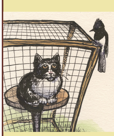
Cat Stats The United States hosts between

a quarter and a third of the global domestic cat population and by far the largest number of cats of any single nation with an estimated total of 148-188 million domestic cats. About 88 million of these are pet cats of which about 57 million are freeranging outdoor cats for at least some part of the day. In addition to this, there are an estimated 60-100 million stray and feral cats, nearly all of which range free outdoors.