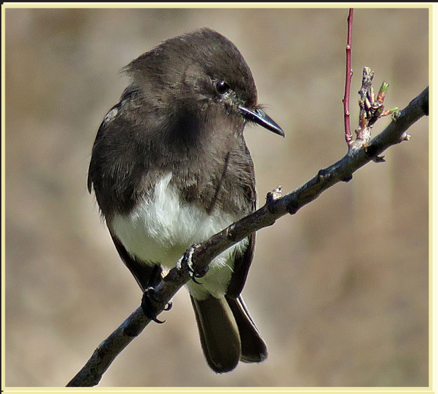
Black Phoebe

For the 21st year, Friends of the Arcata Marsh (FOAM) and RRAS are co-sponsoring a Student Bird Art Contest , with up to $650 in prizes awarded to Humboldt County K-12 students who