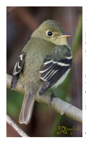
Yellow-bellied Flycatcher

From Tony Kurz: The Arcata CBC on Saturday, December 16, had good participation and quite the amazing day recording a total of 182 species! Numerous highlights lingered until count day, and a few rare species were found the day of the count. Highlights include: Purple Gallinule, Yellowbellied Flycatcher, Gray Flycatcher, Vermillion Flycatcher, Duskycapped Flycatcher, two Blue-gray Gnatcatchers, House Wren, Clavcolored Sparrow, Nelson's Sparrow, three Black and