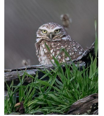
Burrowing Owl courtesy of Jeff Todoroff