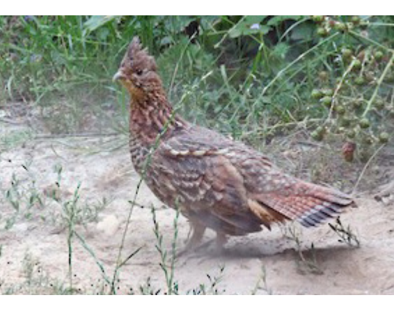
Ruffed Grouse

#162 for the count all-time high (since 1973). Both Snow Goose and Common Goldeneye were reported on only two previous counts in the past 45 years. Ruffed Grouse have been reported on only five previous counts, and 160